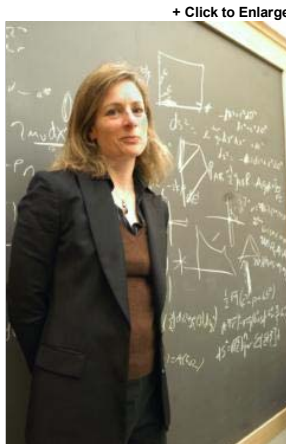
+ Click to Enlarge

Using complicated math, Randall then showed that space and time could be warped. She