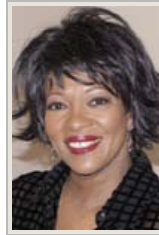
Rita Dove.

Dove is a 1970 Presidential Scholar who received her bachelor's degree summa cum laude from Miami University of Ohio in 1973. She earned her master of fine arts degree from the University of Iowa and received a Fulbright scholarship at the Universität Tubingen in Germany.